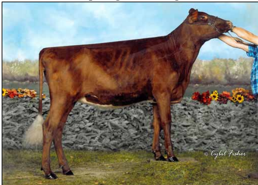
MICHAELS RR GOLDIE EXP HM ALL-AMERICAN SUMMER YEARLING, 2012 DAM OF LOT MS5