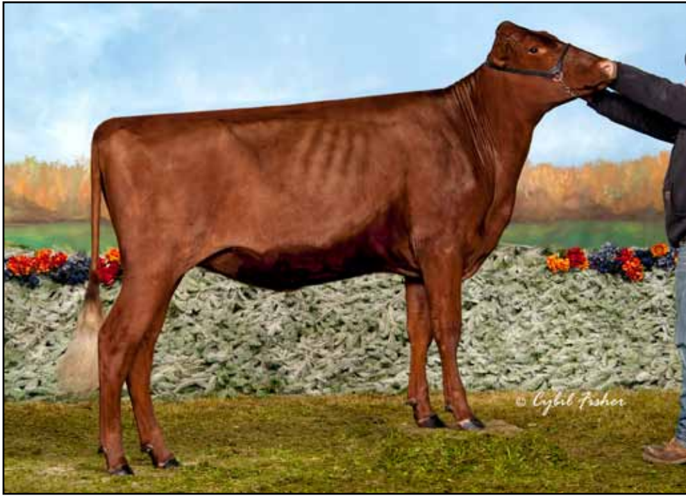
GOLD MINE G IRON DIOR 214 DAM OF LOT MS15