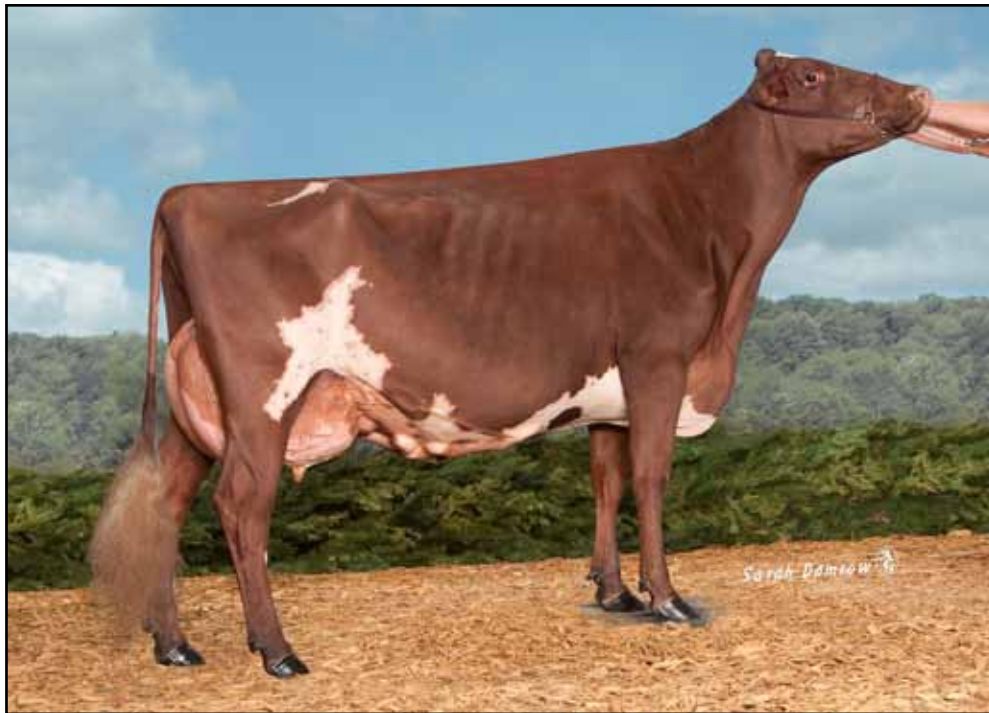
INNISFAIL-WO MEGA LADYLUCK-ET, E90 UNAN ALL-AMERICAN JR 2, 2014 UNAN ALL-AMERICAN JR 3, 2015 DAM OF LOT MS7 S