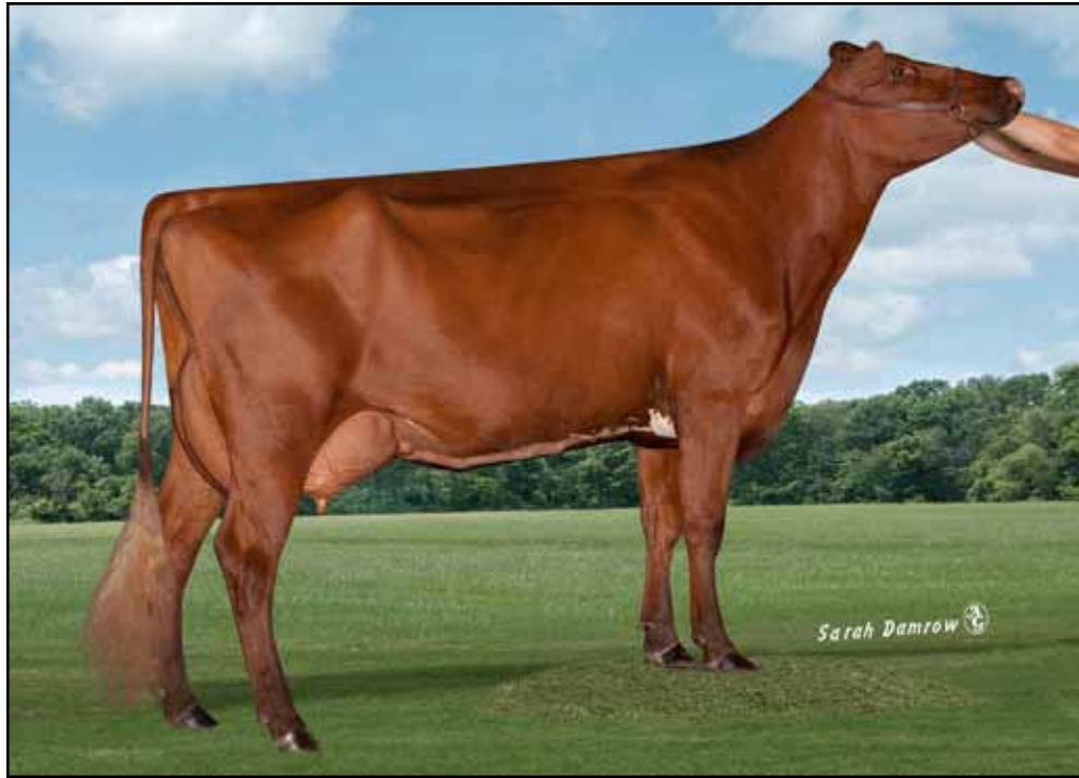
HEAVENLY FLOWER, EX-90 GRAND CHAMPION, 2014 WI STATE FAIR 4-03 291D 20,180M 4.1% 822F 3.0% 609P DAM OF LOT MS14