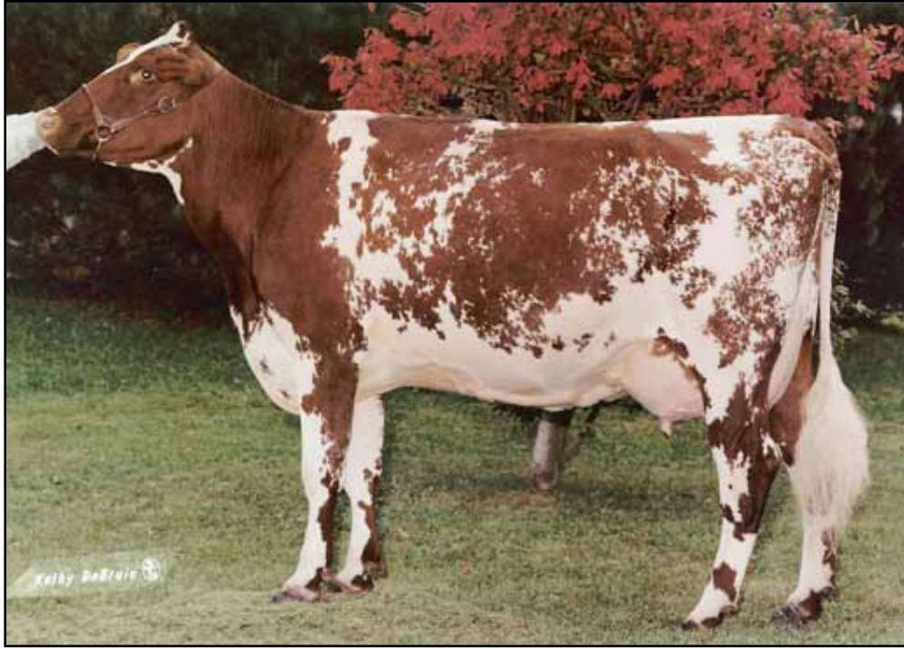
LANDS-BROOK CHRISTIE, 4E-94 7-02 365D 30,830M 4.1% 1251F 3.0% 926P DAM OF 7 EX DAUGHTERS, 7 VG DAUGHTERS & 1 EX SON MANY ALL-AMERICAN RECOGNITIONS IN THIS FAMILY! GRANDDAM OF LOT MS2