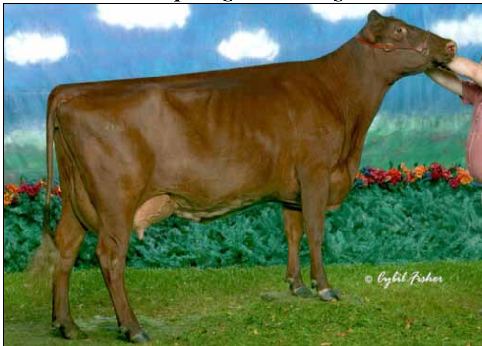
INNISFAIL KO LADY 1022, EX-91 2E RESERVE ALL-AMERICAN AGED COW, 2007 GRANDDAM OF LOT MS4