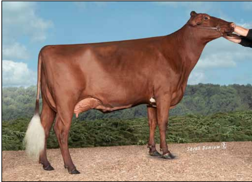
INNISFAIL JO LADY 217 EXP, EX-90 RES. INTERMEDIATE CHAMPION, 2015 EASTERN NATIONAL SELLING AS LOT MS1