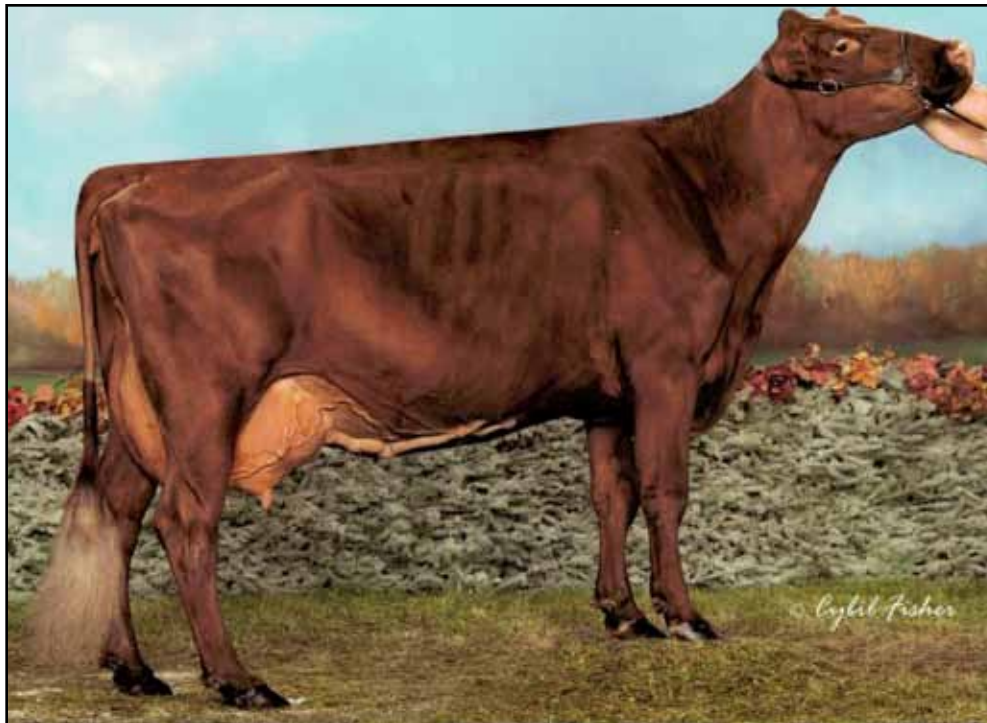
NT O-ME-O-MY LADY, VG-88 DAM OF LOT MS3