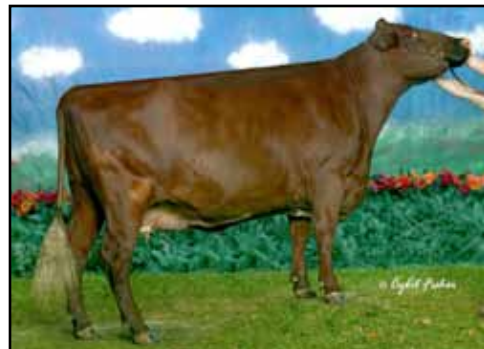
CHERRYWOOD ROYALTY JUDEA IV, EX-92 91M JR ALL-AMERICAN SR 2-YEAR-OLD, 2005 GREAT-GRANDDAM OF LOT MS10