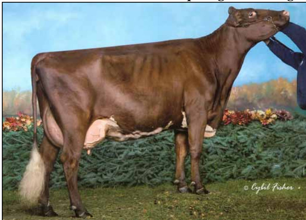
CHERRYWOOD KCLAY JUDEA V, VG-88 ALL-AMERICAN JR 3-YEAR-OLD, 2009 GRANDDAM OF LOT MS10