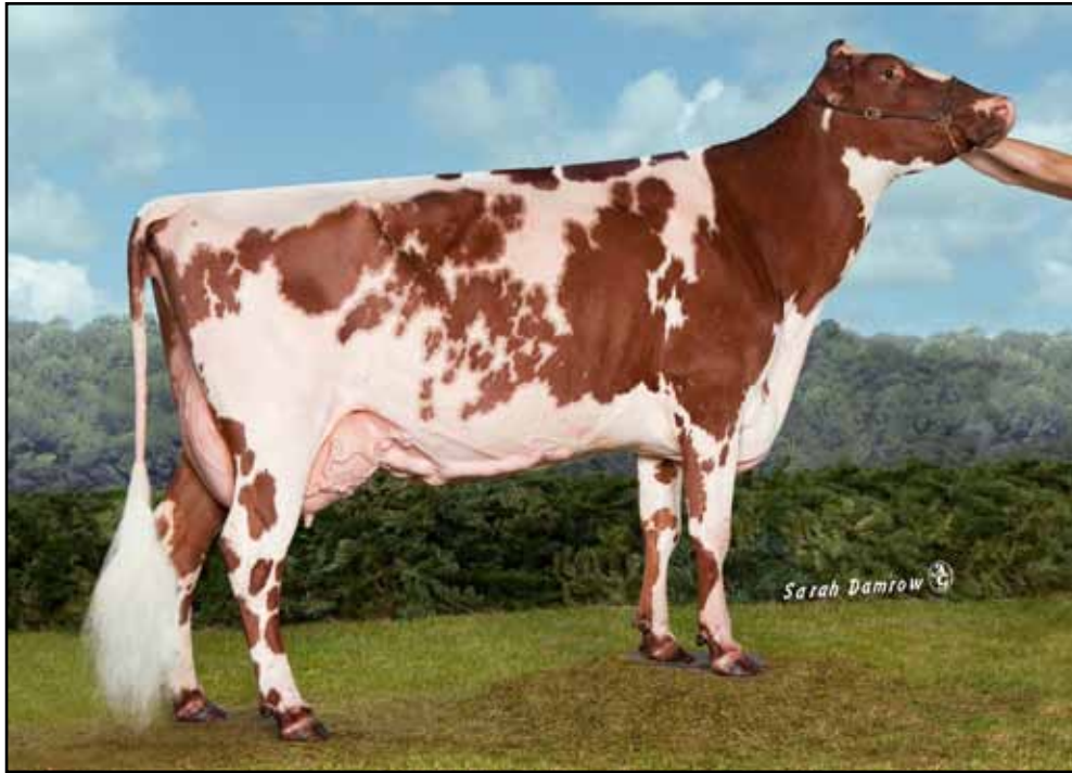
DAN SAL MEGADETH ZENA, EX-94 2E RES. ALL-AMERICAN AGED COW, 2012 5-05 365D 23,520M 3.9% 909F 2.9% 675P GRANDDAM OF LOT MS11